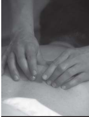
Bad weather on the mountain left time for other activities!