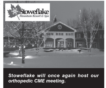
Stoweflake will once again host our orthopedic CME meeting.

The 2007 edition of NHMI's Annual Winter Meeting is slated for March 2-4 at the Stoweflake Resort. All the popular aspects of this program remain in place including the incredible low price ( which includes your Friday and Saturday accommodations and your CME activities ), the perfect schedule which allows time for your education and your recreation in beautiful Stowe, Vermont plus great opportunities for collegial interaction in a comfortable atmosphere. Add in the incredible Spa at the Stoweflake and it's no surprise that this meeting has sold out each of the past two years and we expect 2007 to be just as attractive.