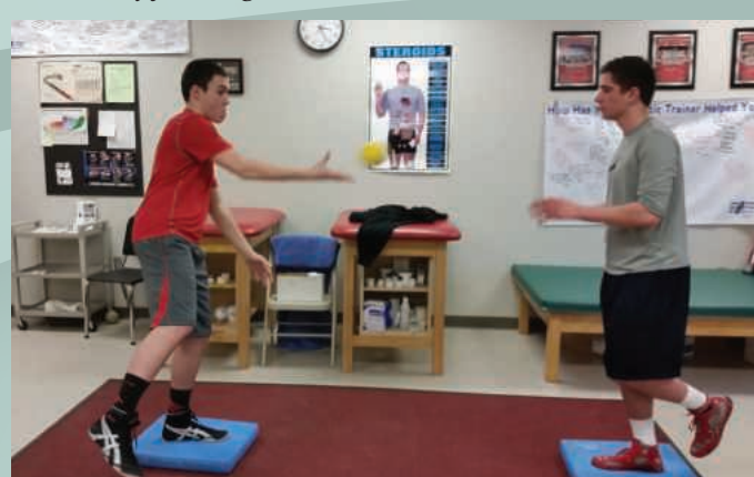
Conveniently, both of these athletes needed the same kind of

what they're doing for these kids. And how much they – and their parents – appreciate it. It's really a great thing. ??