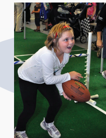
The kids had a BLAST!