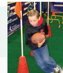
More than 4,000 people attended the Day for Kids. Several hundred kids ran the Safe Sports Obstacle Course...many more than once!