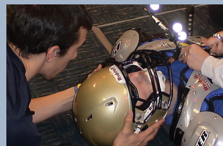
NHMI Research continues to focus on appropriate management of football equipment in emergency situations.