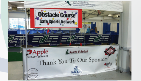
The calm before the storm.